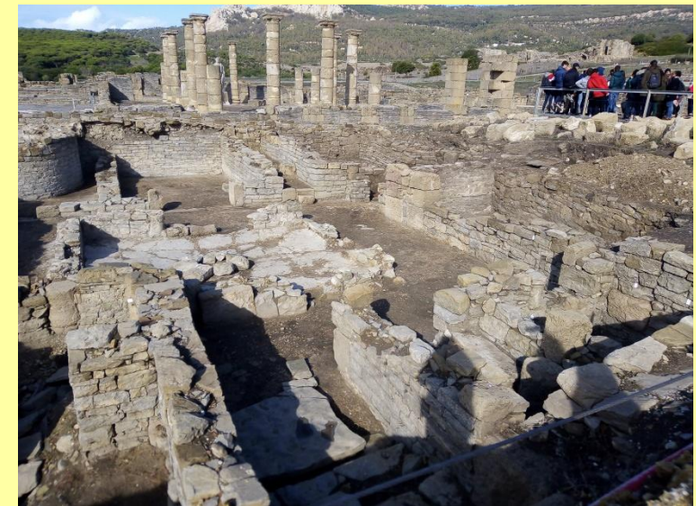
Historical remains of the little and old town in Tarifa.